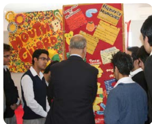
Poster Competition held by 1st Year BDS Students, Department of Science of Dental Materials