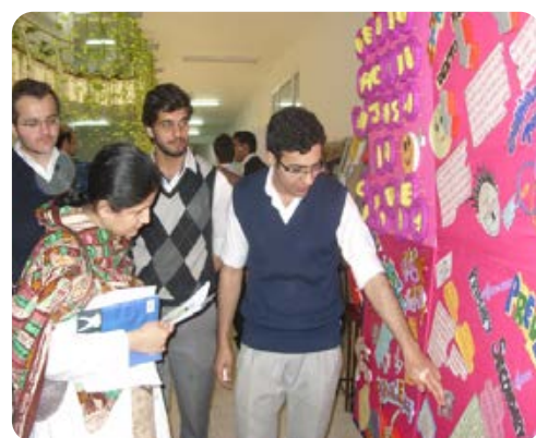
Poster Competition held by 2nd Year BDS Students, Department of Community and Preventive Dentistry