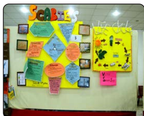
The Second part of the ceremony was poster competition/exhibition by the students. Shown above are the price winning posters. 1st Prize for "Malaria" by 4th Year MBBS, 2nd Prize "Lice are not Nice" while poster on "Scabies" won the 3rd Prize.