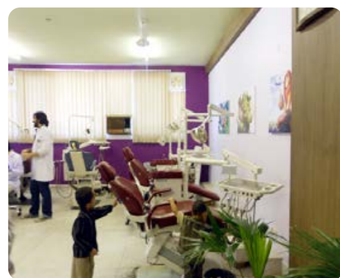
Newly renovated Paedodontics Department