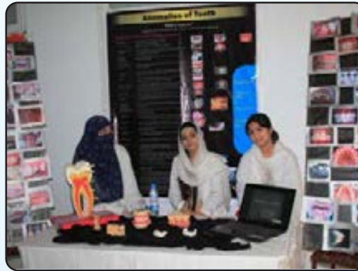
Informative table clinics

Education, Its Assistant Directors, Members and other faculty members of both KMC & SBDC actively participating in organizing and managing these scientific seminars.