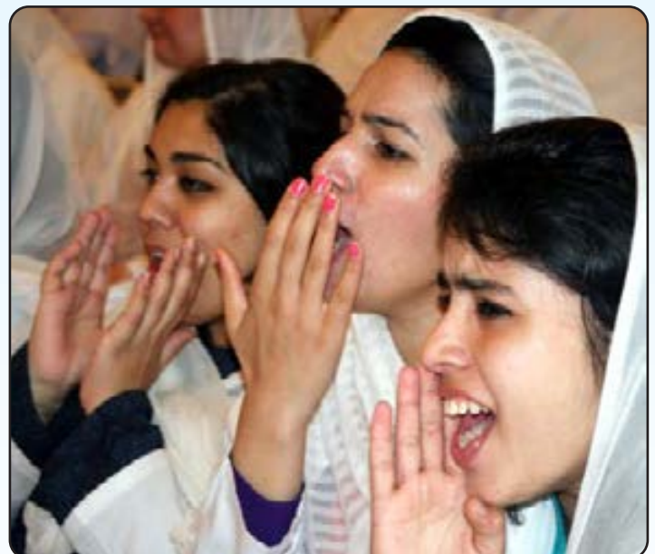
Students encouraging their classmates

presented. Debating, holding quiz events and poetry prepare the students in making good presentations in class, pushing a point of view forward and to become fine, eloquent teachers in the future. Such competitions in literacy are all meant to encourage students to develop their imagination and to gain more confidence.