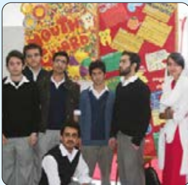
The Prize Winners, 1st Year BDS

One should never miss out on the poster presentations at Gandhara, always artistic and hugely informative