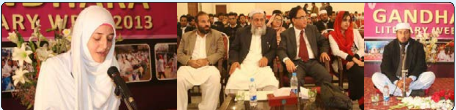
Participants in the Inter-Colleges Qir'rat and Na'at competitions

colleges in Peshawar participated to the fullest, bringing forth their God gifted voices, praising His Ultimate Being. The second half of the event was dedicated to Na'at Competitions praising our Holy Prophet PBUH. Both events were inter-college, with participants coming in from Khyber Medical College, IM Sciences, KPK Agricultural University, KPK Engineering University and many others. It came as no surprise that both Qir'rat and Na'at competitions were won by the Khyber Pukhtunkhwa Agricultural University students, as their control, pitch and Arabic delivery not to forget their voices surpassed all others. Contrary to common belief, the students actively participated and thoroughly enjoyed listening to the soulful Qir'rats and Na'ats.