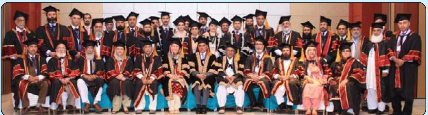
Graduates and Faculty of the Year 2012