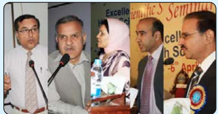
Scientific Seminar Presenters