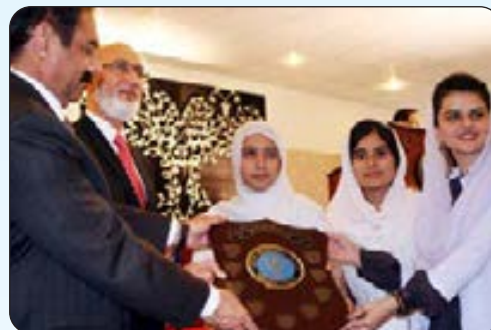
Students receiving the shield for Best Class of 2012

everyone thoroughly enjoyed the event. The literati's intelligent humour left the audience with a dense feeling of elation and understanding. Long live Pakistan and its unique literature and culture!