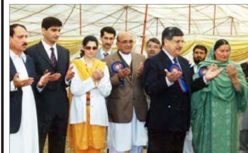
Foundation Stone Laying Ceremony of Kabir Medical College (New University Campus), January 2005